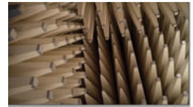
From single test benches up to complex multi-antenna test systems, multiple configurations are available to adapt to your needs.